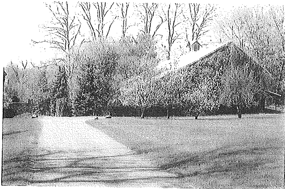
East Elevation, Barn