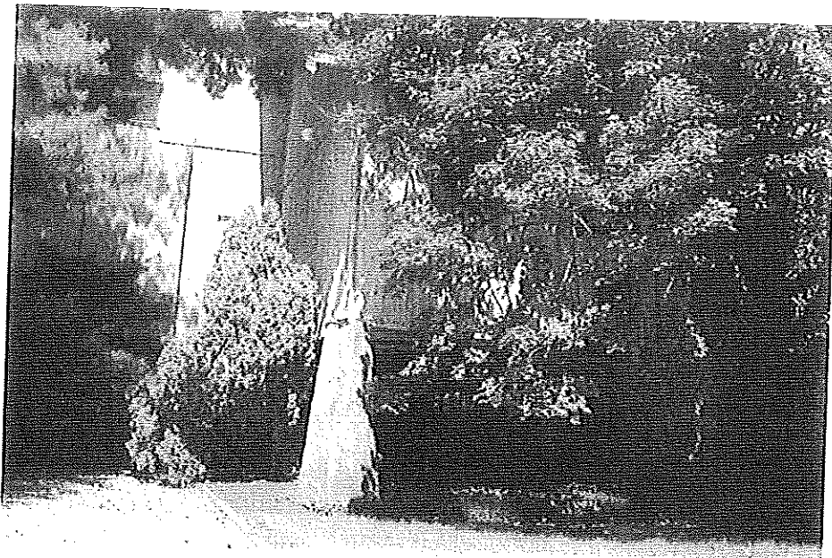
Close-up, South (front) Elevation, Barn, Showing Conical Support