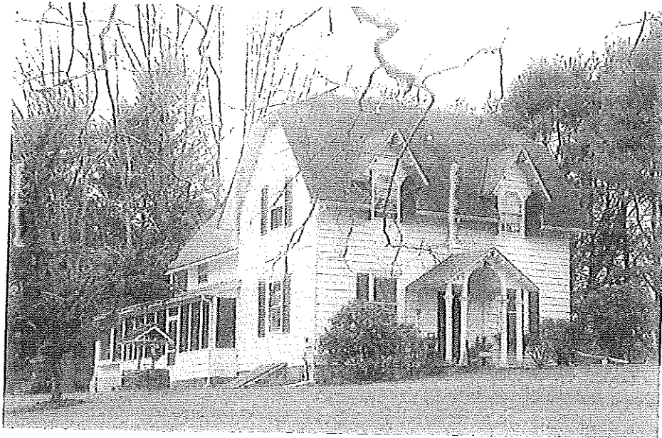
South and East (front) Elevations, House